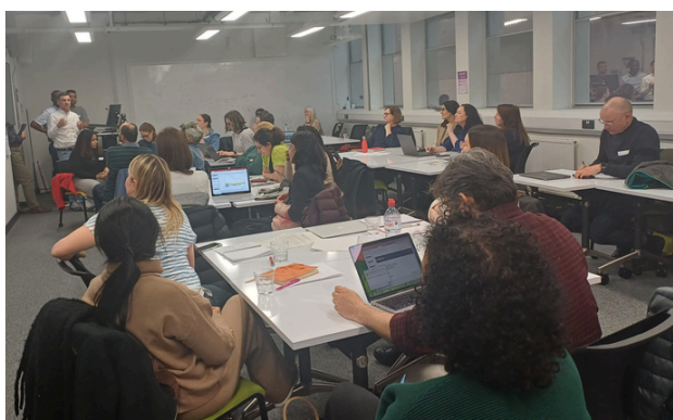
Best Overall Project Winners: team EPIC